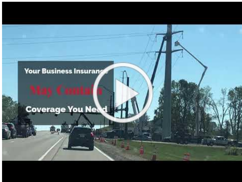
2020 Iowa Derecho Business Interruption Claims

Business owners often have insurance claims available through their own business insurance to compensate for lost income due to shutdowns and restrictions which were put in place by various authorities in efforts to control the spread of the Coronavirus or by losses due to the 2020 Iowa derecho. You may have that coverage and not even be aware.